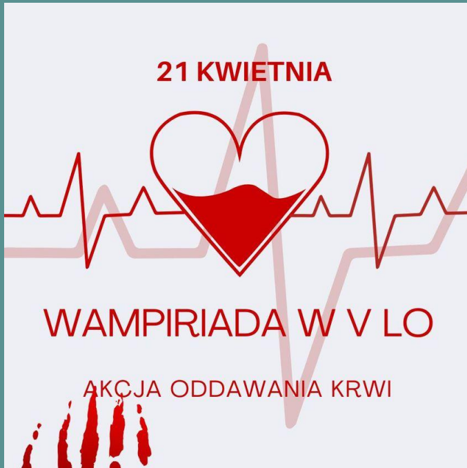
blood donation campaign