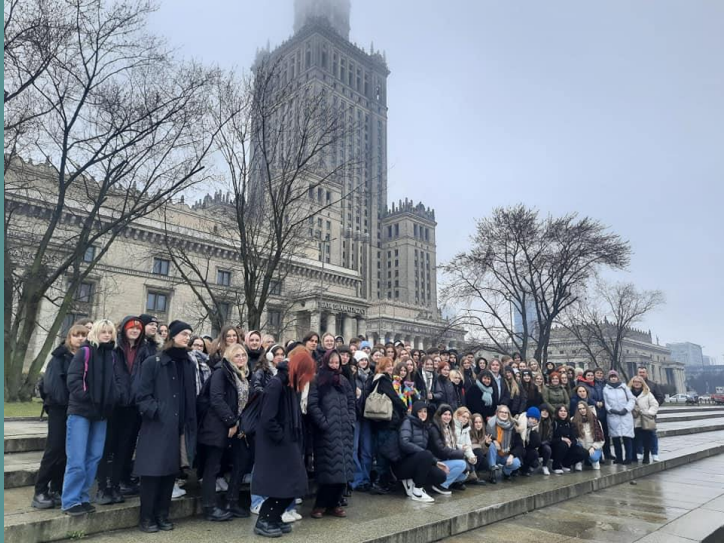
School trip to the capital of Poland - Warsaw