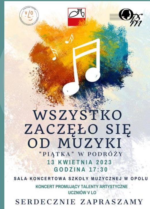
Concert promoting the artistic talents of students of LO V